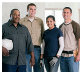
An image of the new World Arthritis Day website using the theme Let's Work Together to support people with rheumatic diseases in the labour market, along with a selection of images from the website