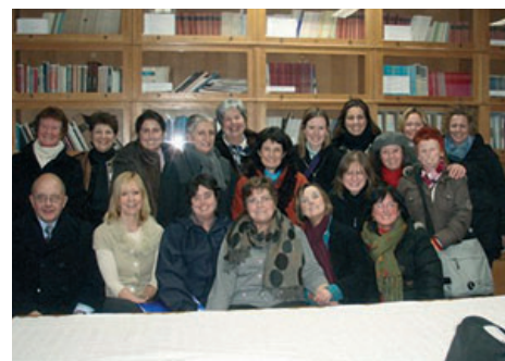
The FESCA board at their meeting in January 2009

congress in Florence in February 2010, at the same time and place as a World Scleroderma Congress for rheumatologists. There will be extramural events, such as a Klee exhibition and lecture. The FESCA activities will be held on 13 February and patients will be addressed by doctors attending the medical congress.