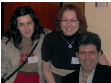
[Top and left] Tallinn is hosting the EULAR Autumn Conference in 2009