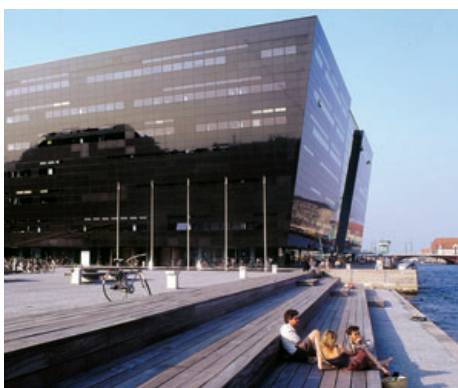
Copenhagen is hosting the EULAR Congress in 2009. Views of the Bella Centre [top], the Danish Parliament [bottom left] and Soren Kierkegaard Square [bottom right]