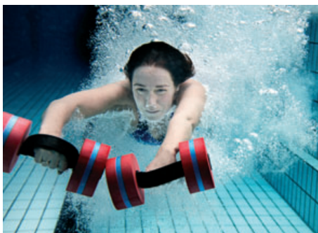
AquaPunkt is one of the successful activities of the Danish Rheumatism Association

We recently launched AquaPunkt, a nationwide campaign on the treatment of