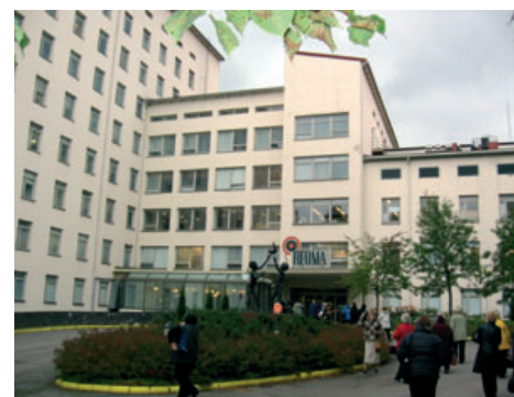
Entrance to the Heinola hospital in Apila Kangasala, Finland

A lot of new and useful information was provided about how the Finnish