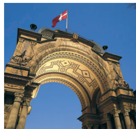
Entrance to the Tivoli Park in Copenhagen