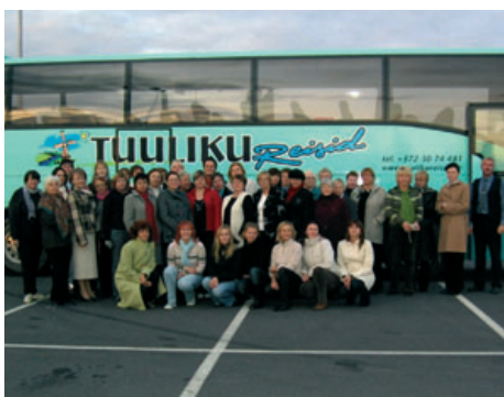
The Estonian group participating in the educational visit to Finland

A group of 45 people took part, including two physiotherapists, a Nordic walking instructor, two nurses, an occupational therapist, a rehabilitation doctor, a journalist and our executive team. The group visited