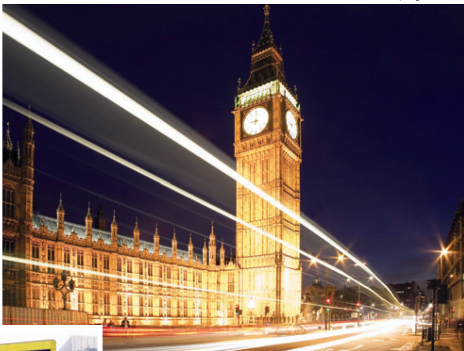
London will host this year's EULAR Congress, which will be held at the ExCel centre (pictured left)