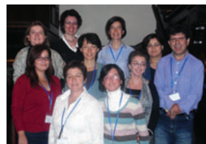
The founding members of Agora at their first meeting in Budapest.

Organisations from Croatia, Montenegro, Romania and Bulgaria have now joined the founding members and other southern European countries are welcome to join.