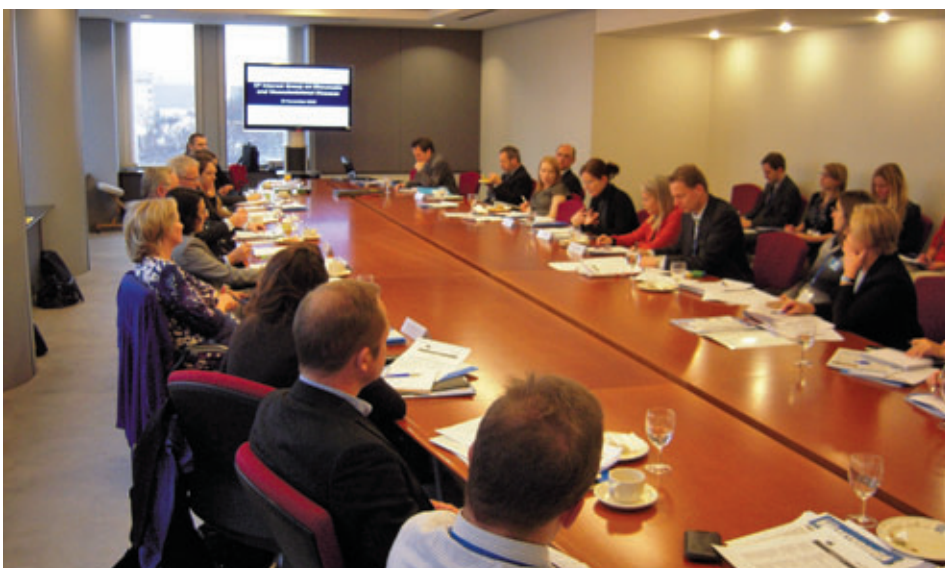
The European Parliament Interest Group meeting on 30 November 2010 was well attended by a significant number of MEPs, Commission officials, Health Attachés from Member States' Permanent Representations and representatives of patient organisations, who discussed health inequalities and rheumatic and musculoskeletal diseases