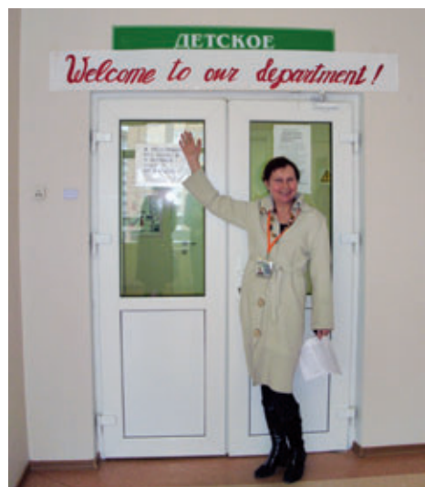
The children's ward at the Institute of Rheumatology is visited by the delegation

The Working Wonders exhibition is continuing to travel across Europe to create awareness of the issues of people with rheumatic diseases at work. Slovakia, Hungary, Croatia, Germany and the Czech Republic are some of the countries where the exhibition is going to stop in 2011. EULAR member organisations interested in hosting the exhibition in their country should contact the EULAR Secretariat for more information at birte.gluesing@eular.org ■