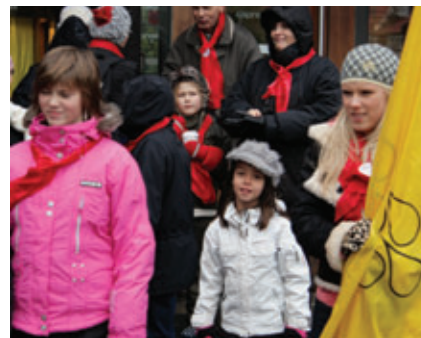
The famous singer Johanna Guðrún (right), who has RA and came second at the Eurovision song contest in 2009, participated in a walk organised in Reykjavik