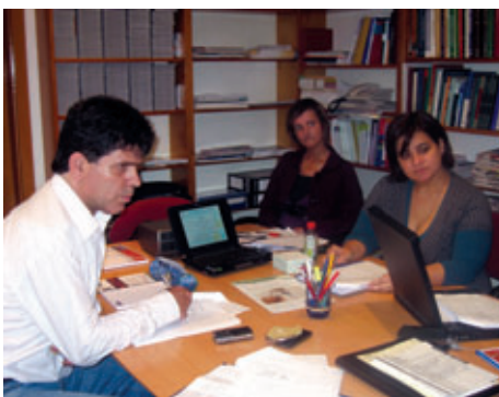
Training on self-management with the Portuguese League and the Cypriot League, which were awarded a grant by the Educational Visit Award in 2007-2008

This year's successful applicants come from Germany/The Netherlands, Greece/Norway, and Romania/Cyprus. The winners have been awarded €5,000 to conduct their projects. The German-Dutch exchange will focus on translating the Dutch self-management programme into practice in Germany, providing people with RMDs