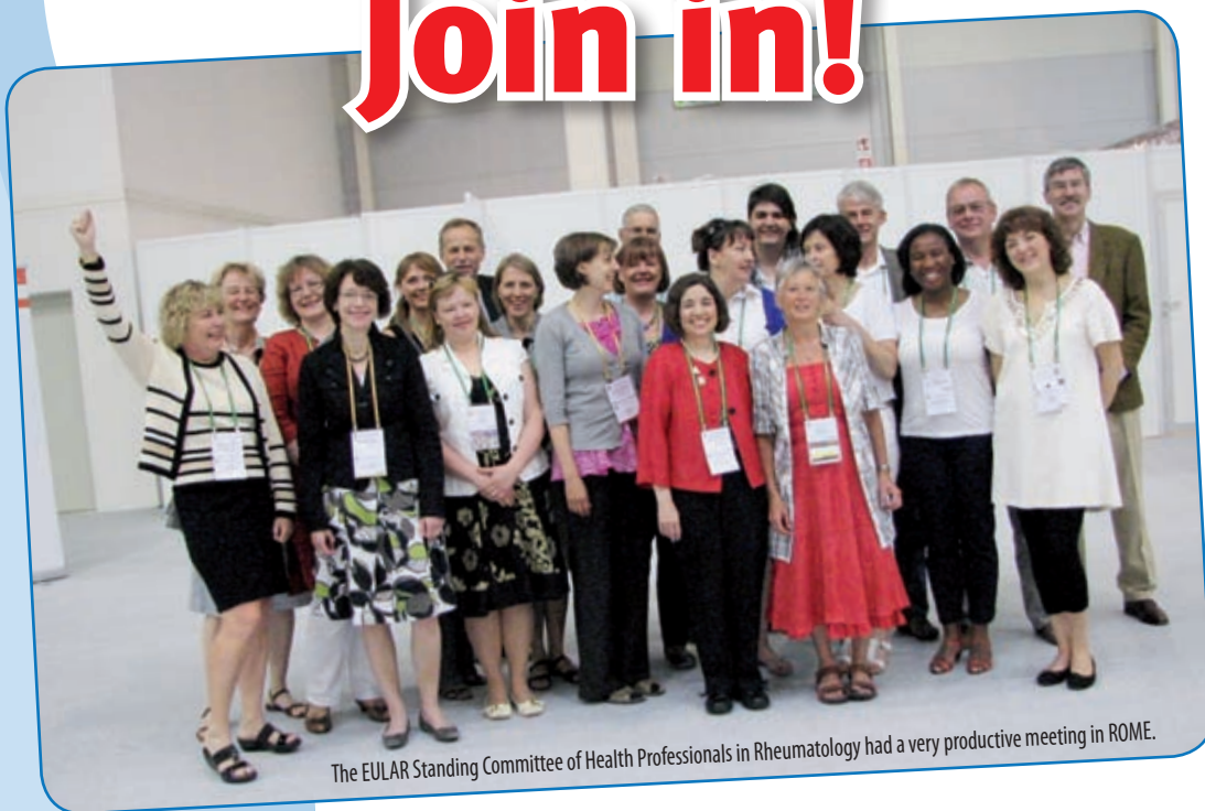
The EULAR Standing Committee of Health Professionals in Rheumatology had a very productive meeting in ROME.