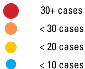
Figure 2: Number of cases in each country

for rheumatologists and other clinicians